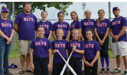
Town of Hammond Summer Youth Softball Team (Girls Division 2017)