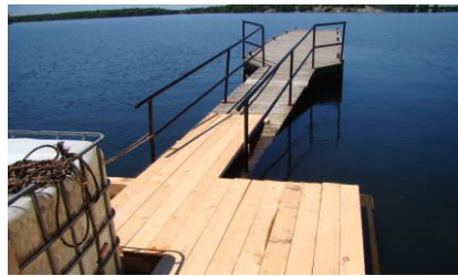
Completed Town Dock System ~ Summer 2017 ~